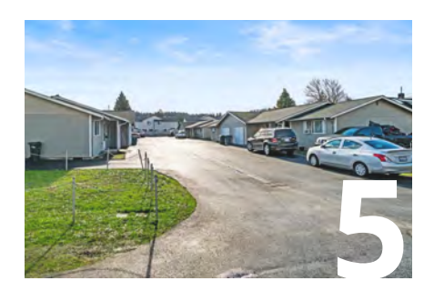
Puyallup 8 Unit