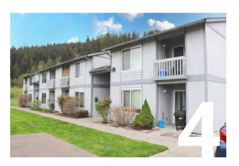
Sumner 8 Unit